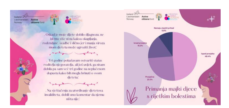
The "WOMEN'S STANCE FOR THE SYSTEM!" Project

Through the web portal and Facebook page Radnica.org (Workingwoman.org), we report on current events and sensitize the public to issues of gender equality in the world of work. In 2023, we published 26 articles on the rights and position of women in the world of work on the web portal Radnica.org. On the portal, women who have experienced discrimination can find all the pertinent information on labor and social rights and can contact us for free legal advice and information.